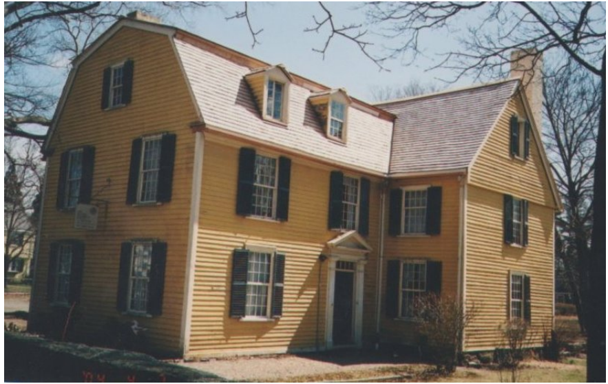
5. The John Hale House