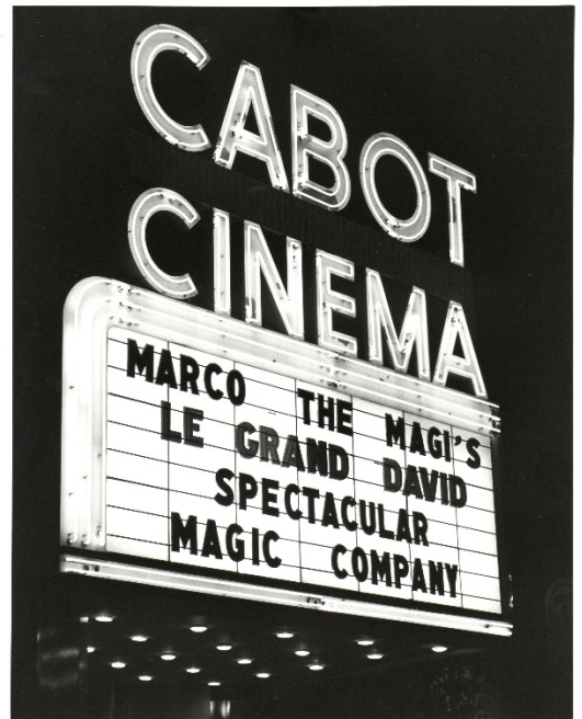
7. A Beverly business