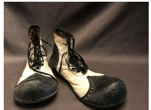
Surath donation-Lil Av