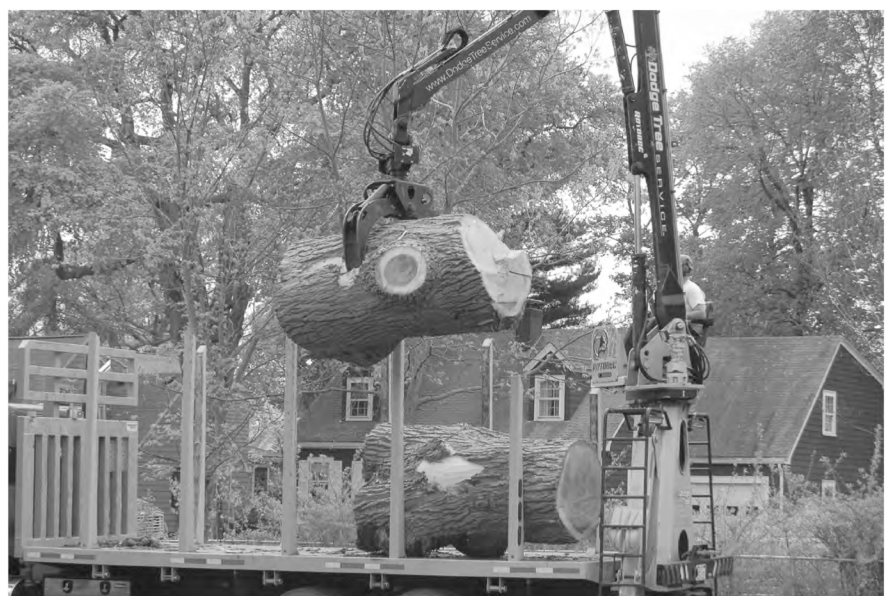
Middle row: Accessible pathway installation at Hale Farm; left and above: historic tulip tree removal from Hale property