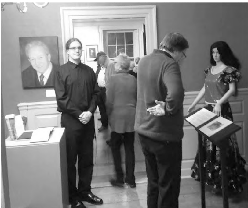
Opening reception for ¡Viva la magia! The man behind Le Grand David and His Own Spectacular Magic Company