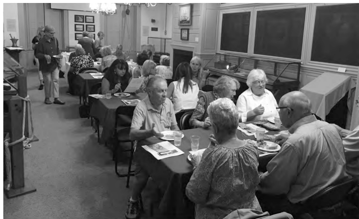
Beverly Improvement Society Meeting