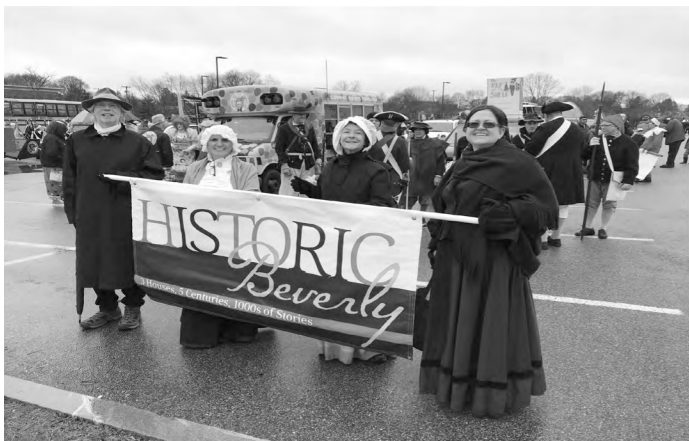
Historic Beverly in the Holiday Parade!