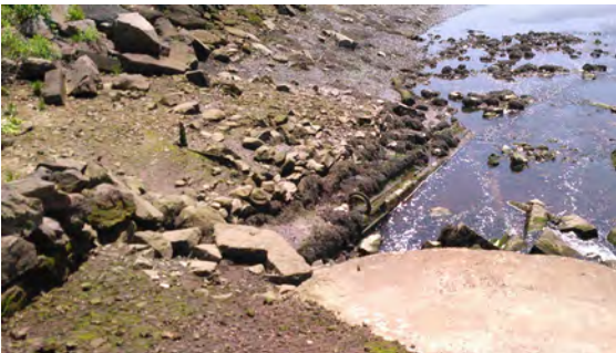
Ruins of Friend's Mill