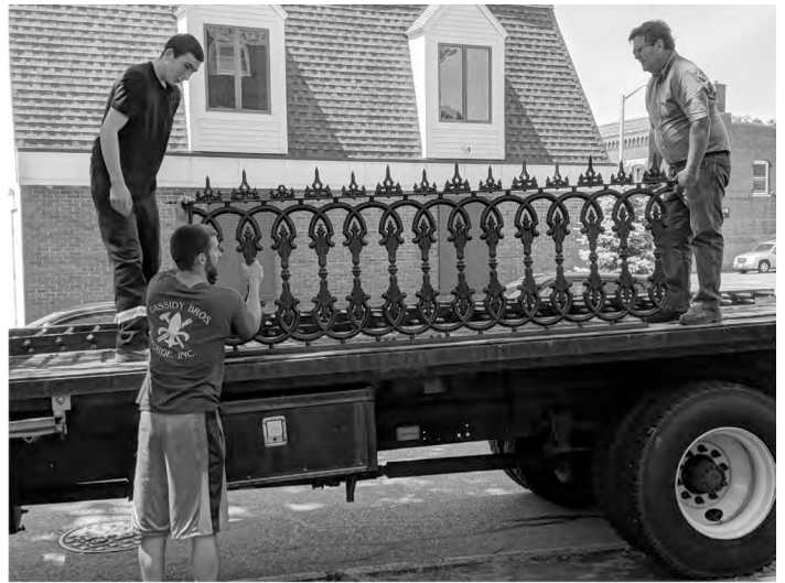
Cabot House fence on its way to Cassidy Forge