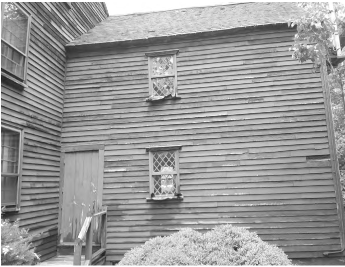
Continuing work at the Balch House